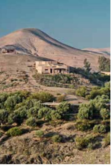
From left: poolside at Les Jardins de Villa Maroc; La Pause's spectacular desert locale

What's interesting about the hotel is its architecture -11 striking structures, described by hotel employees as the Star Wars village and a Smurf village but officially known as Ecodomes. They're rounded, mud-walled structures with lovely furnishings like geometric-patterned textiles and